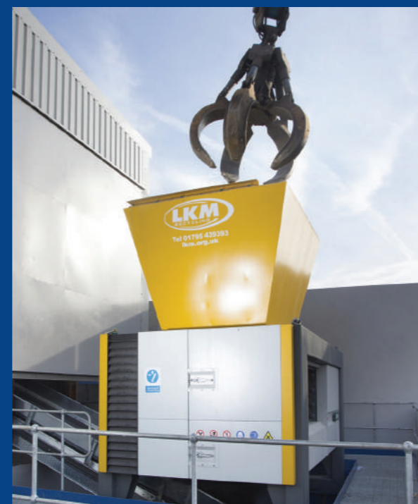
LKM's New Shredding Facility

Swift Discreet Secure Monitored Certified